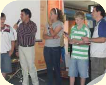
People texting to win a mobile phone