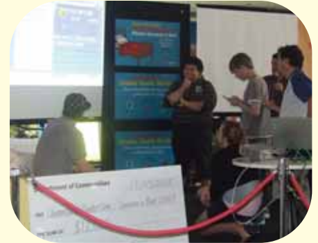
Mobile TY Competition